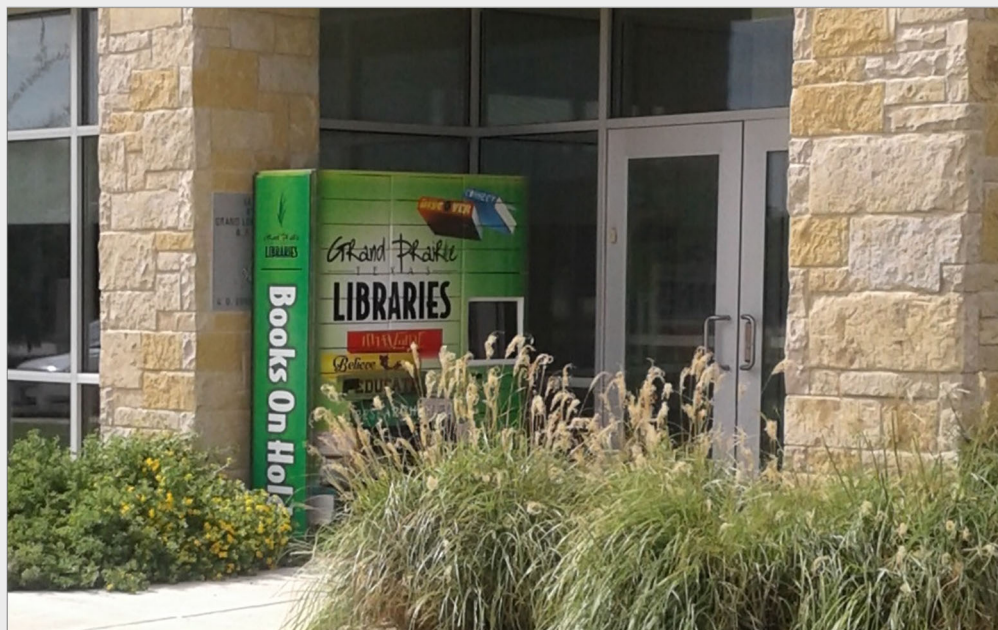
D-Tech's custom-colored, 32-bay HoldIT at the Grand Prairie Library in Texas.